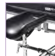
Elevating Calf Support