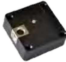
PS Solo Lock (PL)