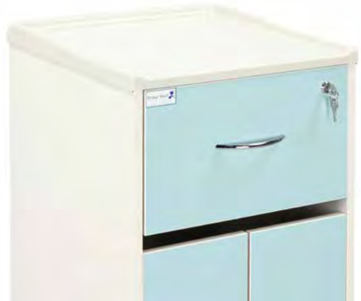
RPT shown with BC1C/GW