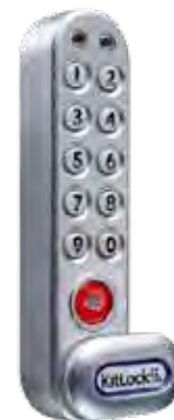
Electronic Push Button Lock (CL)