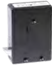
EBC Lock (L15)