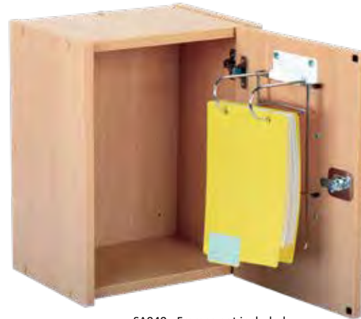
SA040 - Frames not included