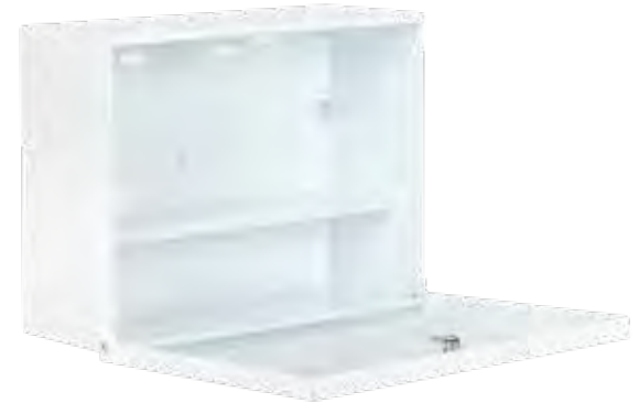
SAC/FS/4 Shown with cabinet SAC/413/B