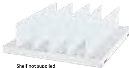
Shelf not supplied