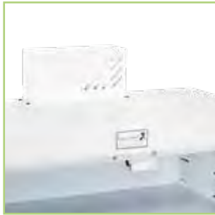
*Lighting Transformer Housing Adds 125mm to Overall Height