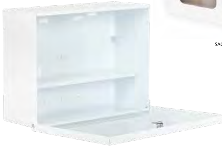
SAC/413/B Shown with optional shelf SAC/FS/4