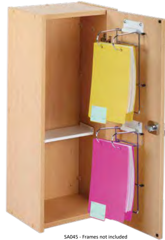
SA045 - Frames not included