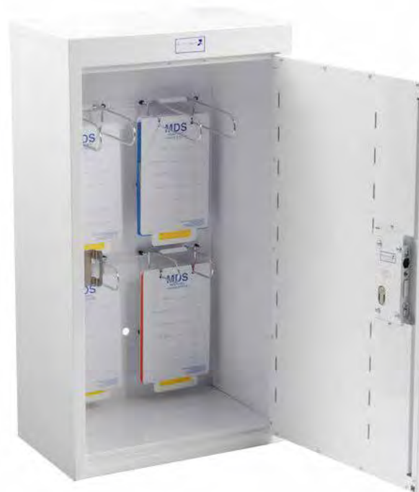
PC539/MDS/LX (Frames not included)