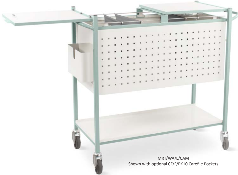
MRT/WA/L/CAM Shown with optional CF/F/PK10 Carefile Pockets