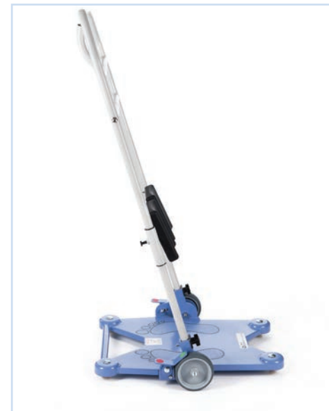
5OX/AC/PKC - Optional Padded Knee Covers

Even weight distribution ensures excellent stability and manoeuvrability