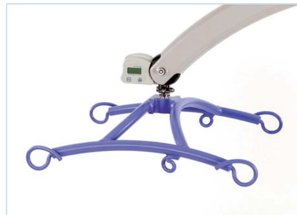
6-point cradle provides improved comfort and support