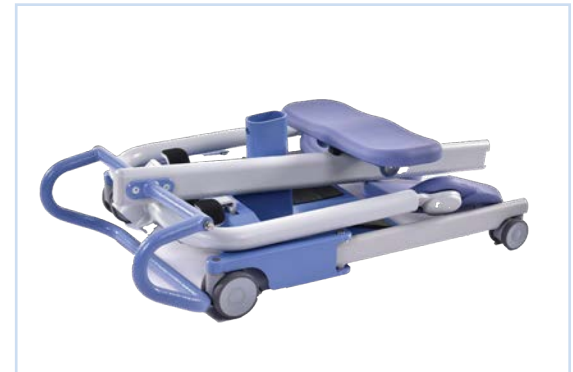
Disassembles for easy storage