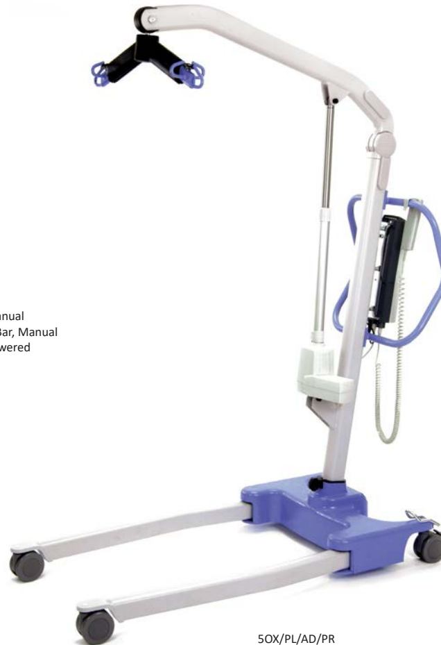
Shown with 4-point positioning cradle