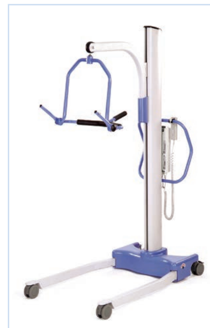
Hoist not included