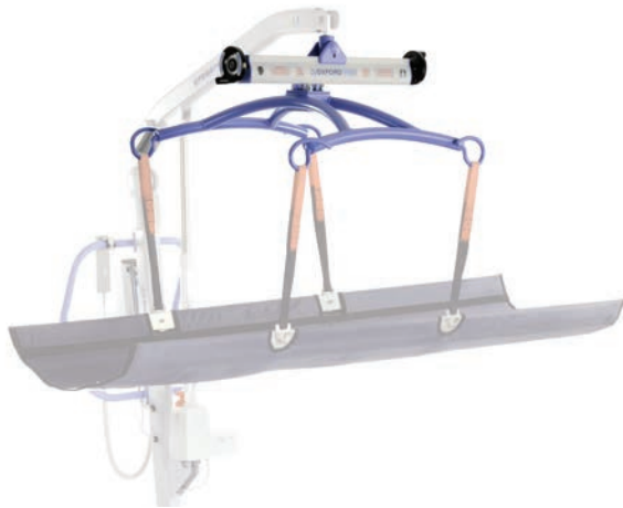
Shown with optional Oxford® Canvas Stretcher