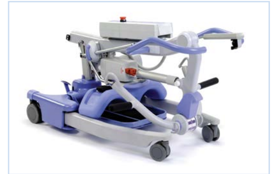
Folds down for easy storage