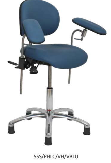
Replace suffix on the product code with any of the following to select your colour e.g. Phlebotomy Chair, Variable Height in Blue 5SS/PHLC/VH/VBLU