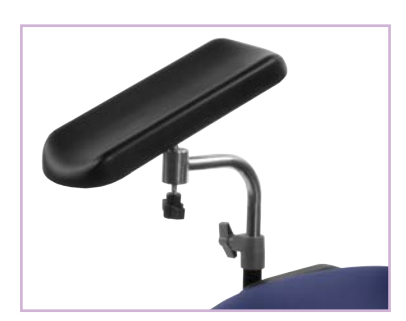
E15 Optional Phlebotomy Single Armrest

Replace suffix on the product code with any of the following to select your colour e.g. Phlebotomy Four Leg Chair in Rust Vinyl - TS/PH/ \vee\vee RT