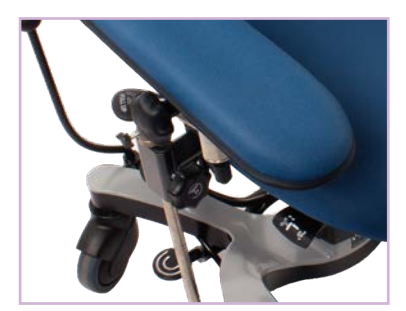
Seat Adjustment Controls