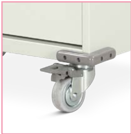
Low Level Corner Bumpers & Steel Castors with braking