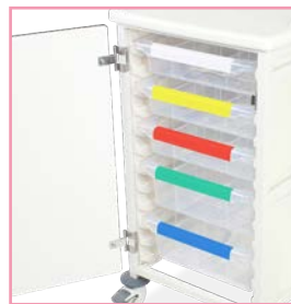
Shown with Door Open