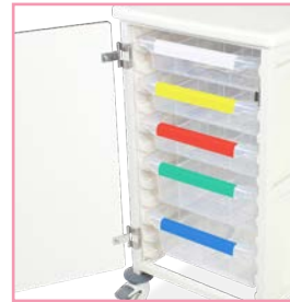
Shown with Door Open