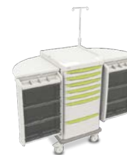
IV Therapy 85XRSIV