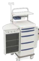
Critical Care 85XRSCCU