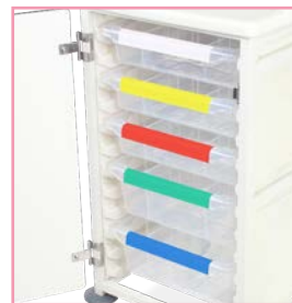
Shown with Door Open