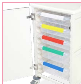
Shown with Door Open