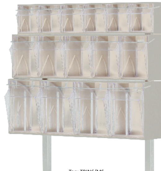
Top: TBIN6/MS Middle: TBIN5/MS Bottom: TBIN4/MS