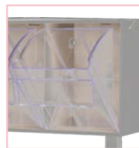
45° Angle Tilt