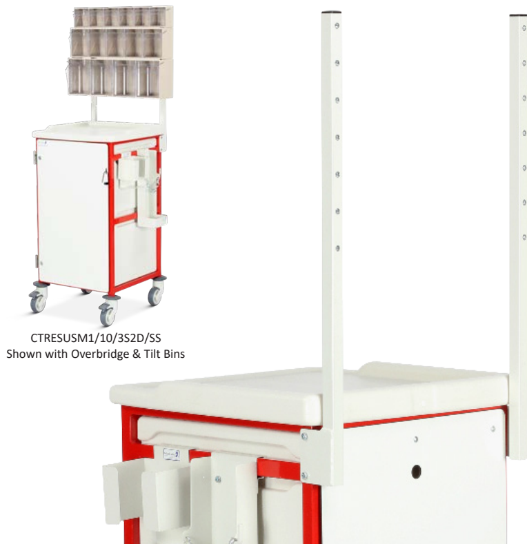
CTRESUM1/10/3S2D/SS Shown with Overbridge & Tilt Bins