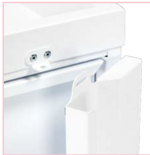
MW015 Tamper Evident Panel