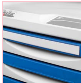
Drawer Label Holders