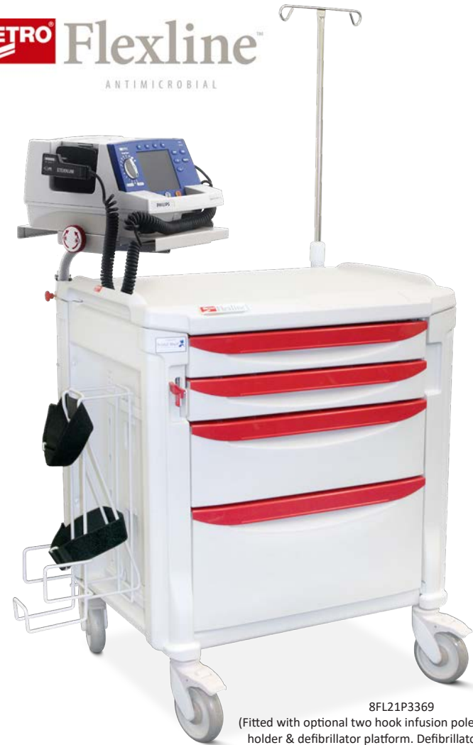
8FL21P3369 (Fitted with optional two hook infusion pole, oxygen cylinder holder & defibrillator platform. Defibrillator not included)