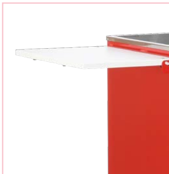
Lift up work flap