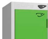
GD Green Door