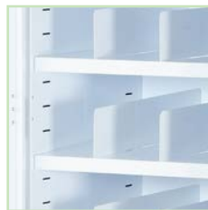
Shelves & Dividers