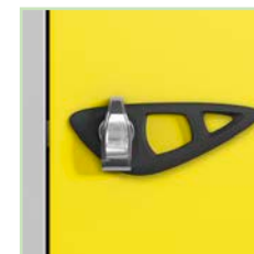
Hasp & Staple Lock