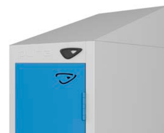
5PL915 - Locker shown with optional sloping top