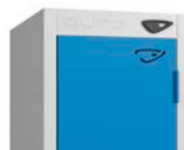
BD Blue Door

Replace suffix on the product code with any of the following to select your colour e.g. Single Bank with a Green Door - 5PL080/GD