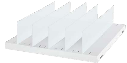
Shelf not included