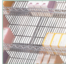
Open Wire Shelf Design