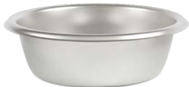
2MECO079 7 Litre Stainless Steel Bowl