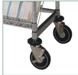
Steel Castors for Easy Moving