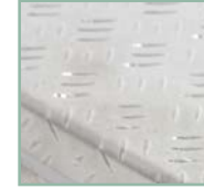
Aluminium embossed non-slip tread