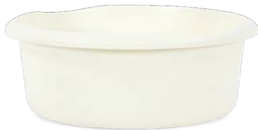
2PLCO054 7 Litre Polythene Bowl