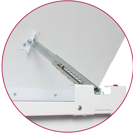
Angle adjustable chartboard (adjustable 0 - 50 degrees)