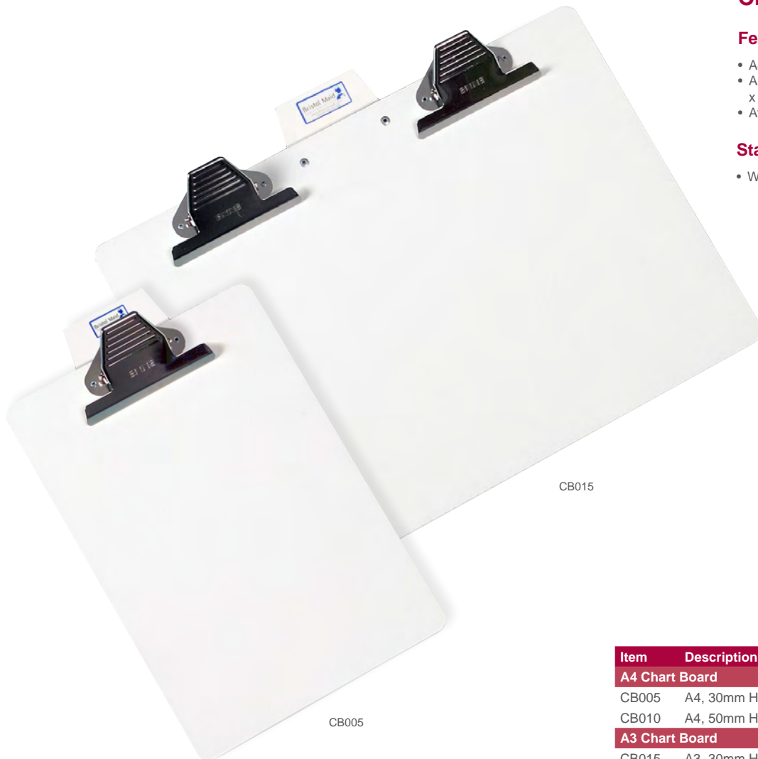
Chart Boards - A4 & A3