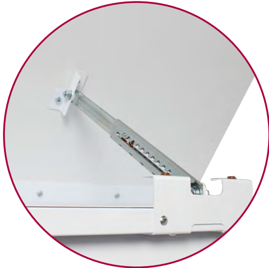
Angle adjustable chartboard (0 - 50 degrees)