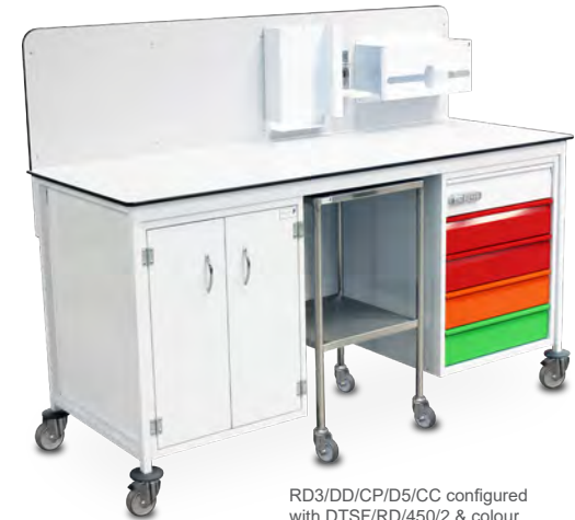
RD3/DD/CP/D5/CC configured with DTSF/RD/450/2 & colour coded drawers