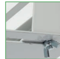
Laptop supported in a cradle fitted with a steel mounting bracket that can be fixed using either nyloc or wing nuts