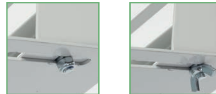
Laptop supported in a cradle fitted with a steel mounting bracket that can be fixed using either nyloc or wing nuts