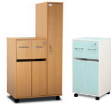
Bedside Cabinets Page 18 -31