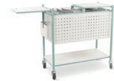
Medical Records Trolleys Page 244 - 245