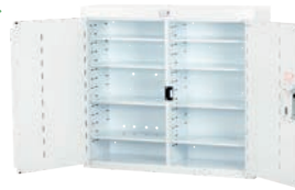
Drug & Medicine Cabinets Page 140 -148