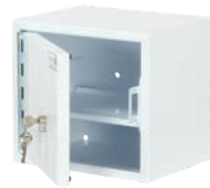
Controlled Drug Cabinets Page 150-151