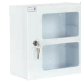
Self-Administration Cabinets Page 156-158