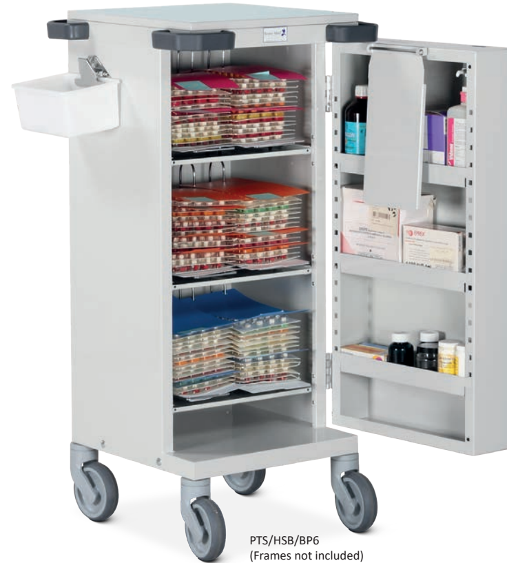
PTS/HSB/BP6 (Frames not included)