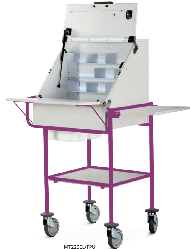
MT220CL/FPU (Shown with optional purple frame)

Alternative colours available at extra cost. Change suffix 'FPU' on the product code with any of the following i.e. in signal green - MT220CL/FSG