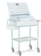
Drug & Medicine Dispensing Trolleys Page 122 - 125