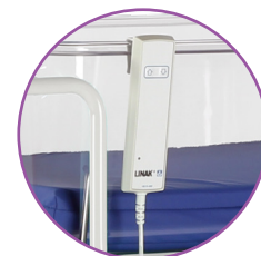
Supplied with a handset