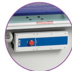
Rechargable battery located at the rear of crib