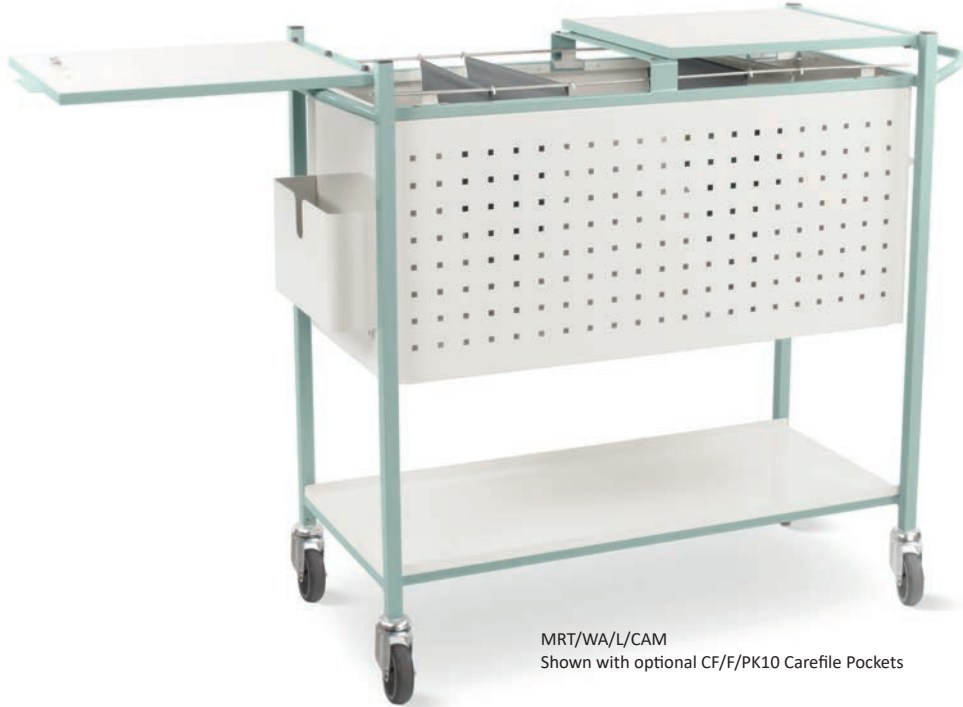
MRT/WA/L/CAM Shown with optional CF/F/PK10 Carefile Pockets