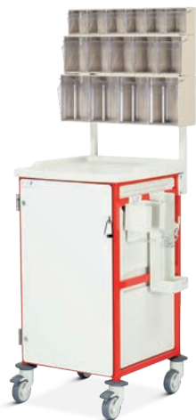
CTRESUM1/10/3S2D/SS shown with Overbridge & Tilt Bins