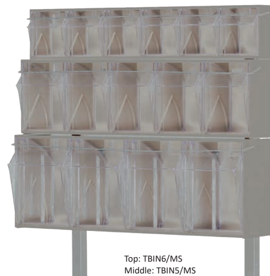
Top: TBIN6/MS Middle: TBIN5/MS Bottom: TBIN4/MS