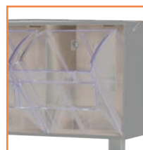
45° Angle Tilt