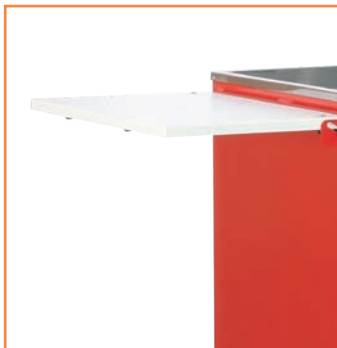
Lift up work flap