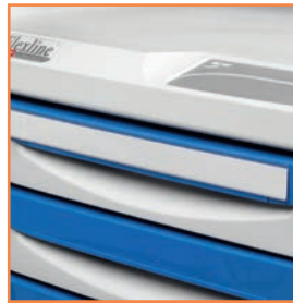
Drawer Label Holders