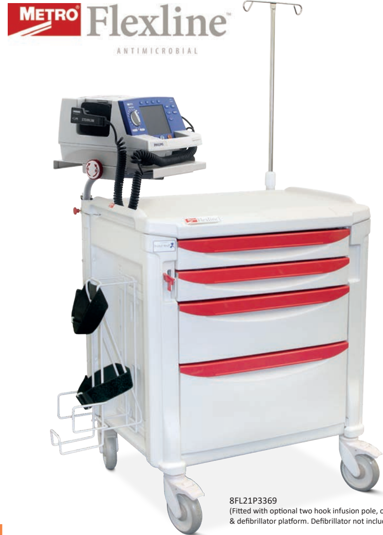
8FL21P3369 (Fitted with optional two hook infusion pole, oxygen cylinder holder & defibrillator platform. Defibrillator not included)