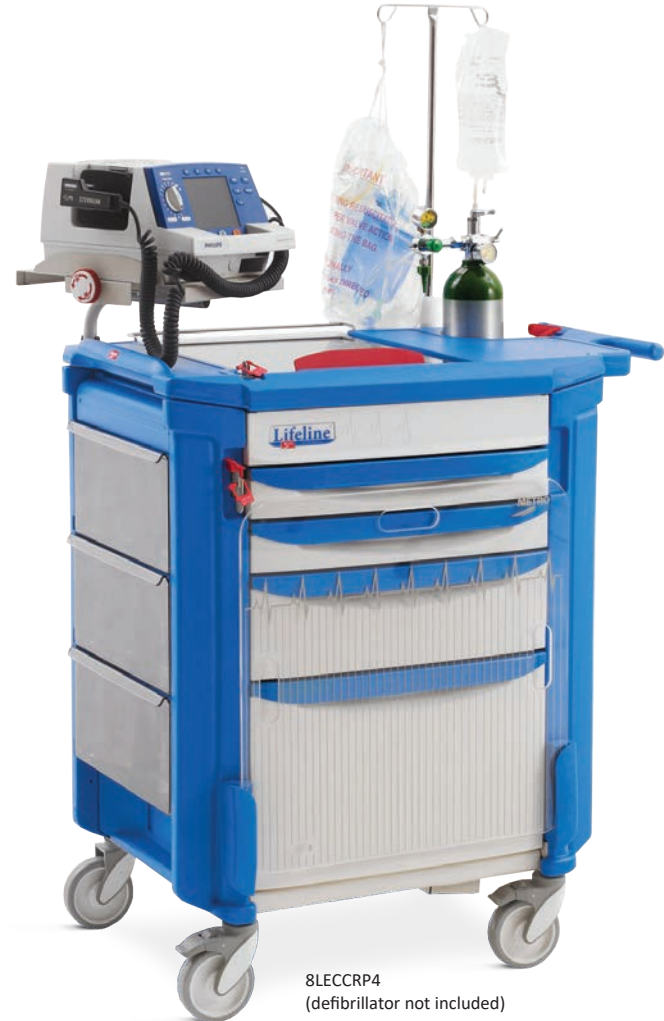
8LECCRP4 (defibrillator not included)