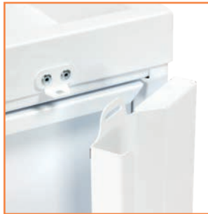
MW015 Tamper Evident Panel