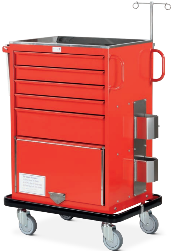
WT250/CYL/D/E shown with optional cylinder holder WT/CYL/D/E

Drop down cupboard door prevents drawers from being opened. Can be secured using security seals.