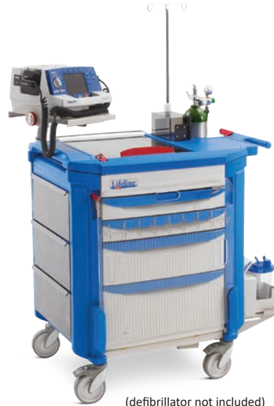
(defibrillator not included)