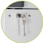
High Security Bolt Lock