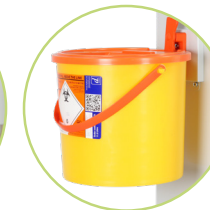
Daniels Healthcare 7L & Above**