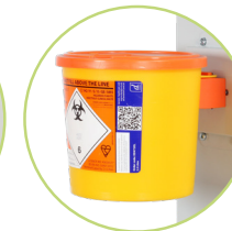
Daniels Healthcare Up to 5L**