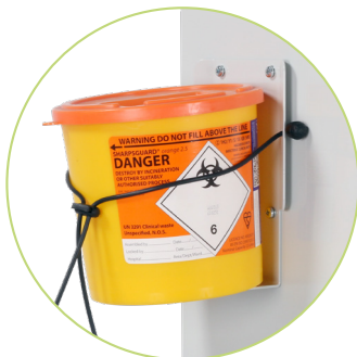
Sharps box not supplied