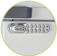
Electronic Push Button Lock