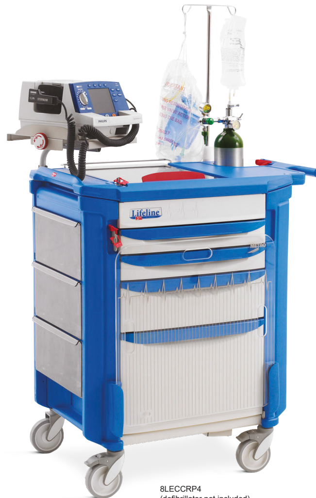
8LECCRP4 (defibrillator not included)