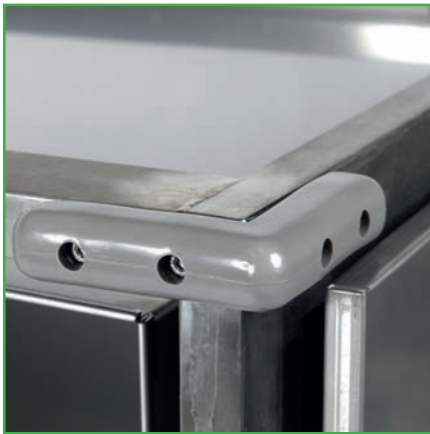
High Level Corner Bumpers