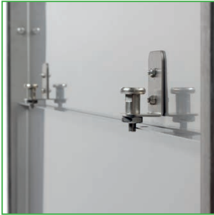
Drip Tray Locates at Rear of Trolley During Cleaning