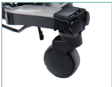
Anti Static low rolling resistance castors