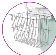
BA903 - Wire Basket