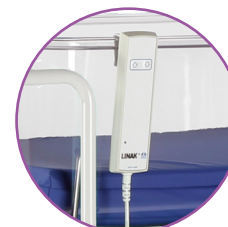
Supplied with a handset